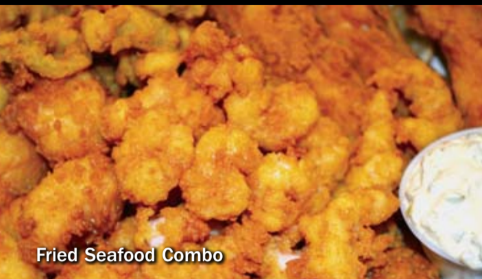
Fried Seafood Combo

All Entrées are served with salad or cole slaw, potato or rice and rolls unless otherwise noted. The Vegetable of the Day may be substituted or ordered as an extra for 2.75 Double Entrée will be twice the cost minus 1.70 Entrée Side Orders will be the cost less 1.35